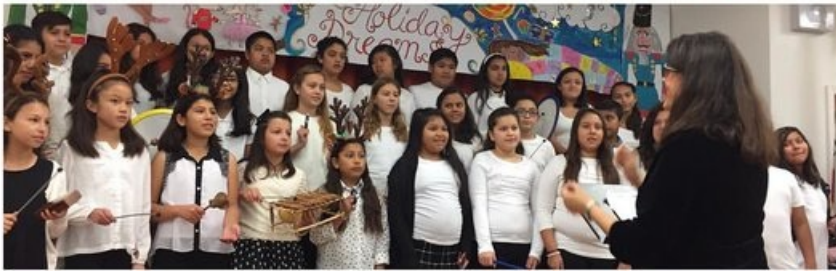
Elysian Valley Holiday Seniors Luncheon